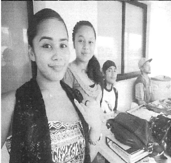
Chuu-Chok Bake Sale Outside of Admission Building.